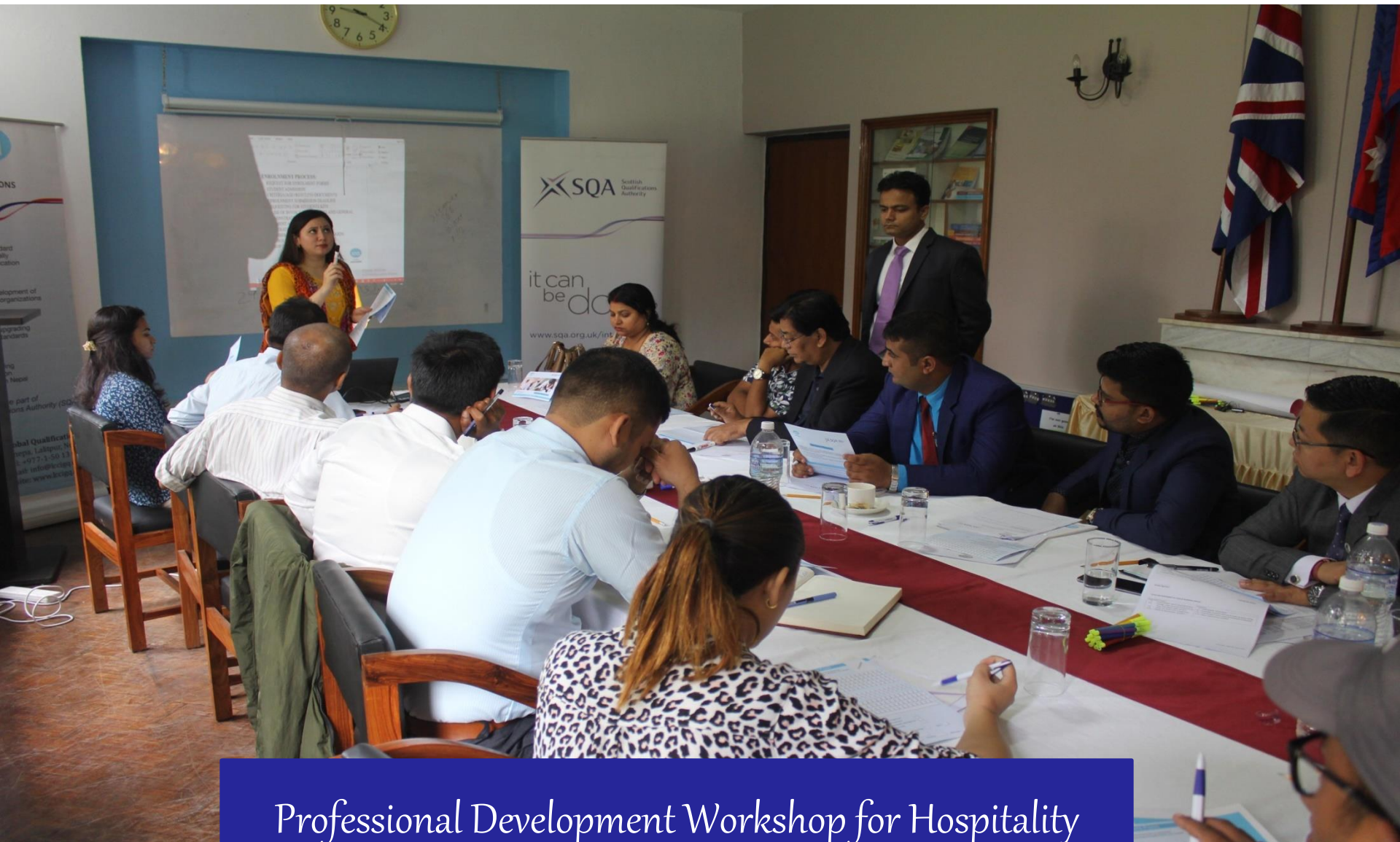
Professional Development Workshop for Hospitality Partner Centre's & team.