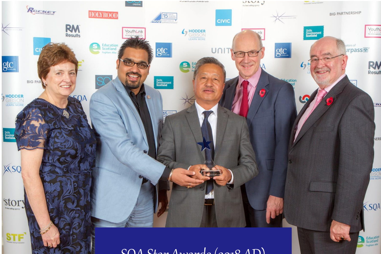
SQA Star Awards (2018 AD)